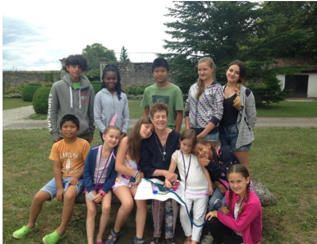
Young people from England, Switzerland, Ukraine and South Africa join together at the Conference in Geneva in the summer of 2015

NOTE: We also have informal groups and Spiritual Living Circles programs in many other countries!